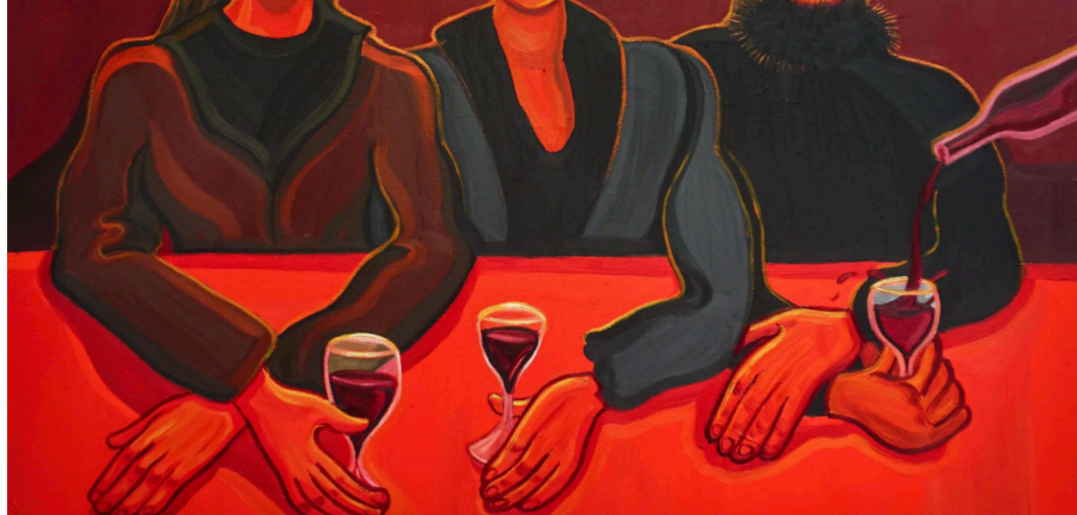
Red Wine Ladies, 2021, 140 x 120 cm, oil on canvas. Credit: Ania Hobson, SETAREH.

Ania Hobson's women often look like they don't want to be in the spaces they find themselves in: ready to leave the party, staring at wine to avoid a conversation, planning an Irish goodbye. Her characters are dressed cool and distinct in their clothes, expressions and poise. Ania Hobson (b.1990) from Suffolk, UK, paints large canvases filled by young people, often in groups, as they socialise and scheme where to head to next. They ponder their direction in life at a dining room table, catch up with friends, take a sofa nap, check out a hot passerby.