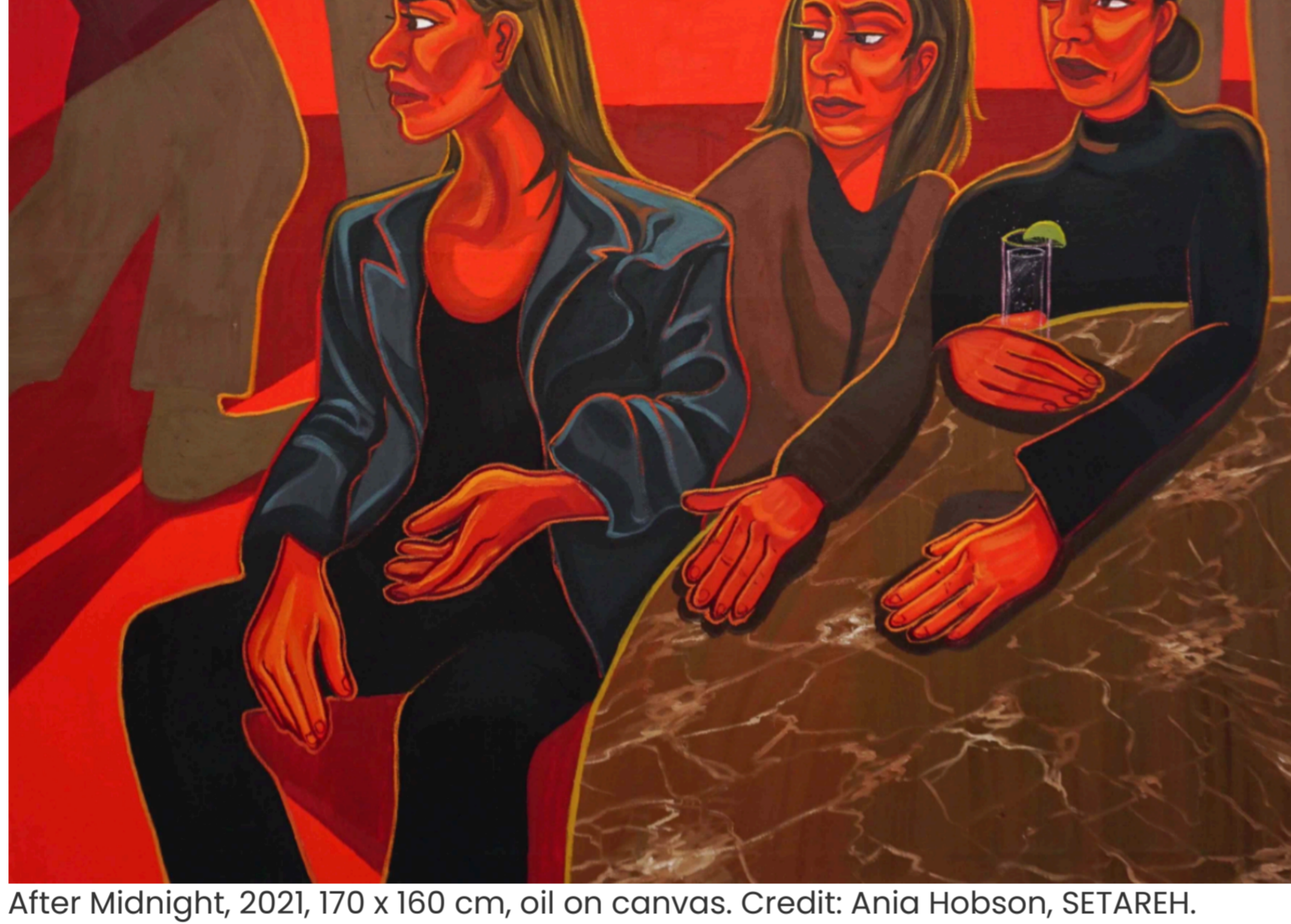
After Midnight, 2021, 170 x 160 cm, oil on canvas. Credit: Ania Hobson, SETAREH.

Some works depict intimate close-ups of characters cradling their drinks of choice (Sobieski vodka, martinis, wine), while larger scenes of clustered figures inside and outside bars see hair, bodies and cigarettes lit up in outlines of yellow and orange. The paintings have heat to them, felt viscerally against the backdrop of white gallery walls, leaving surrounding space for the viewer to imagine the scenes they cannot see. The characters often appear resoundingly gloomy. Perhaps this feels dated as those who are attending newly reopened nightlife venues are gleefully grasping it. However, Hobson's paintings feel very tongue in cheek, seeing the humor in the drama of nights, as people seek a mood switch, a different atmosphere.