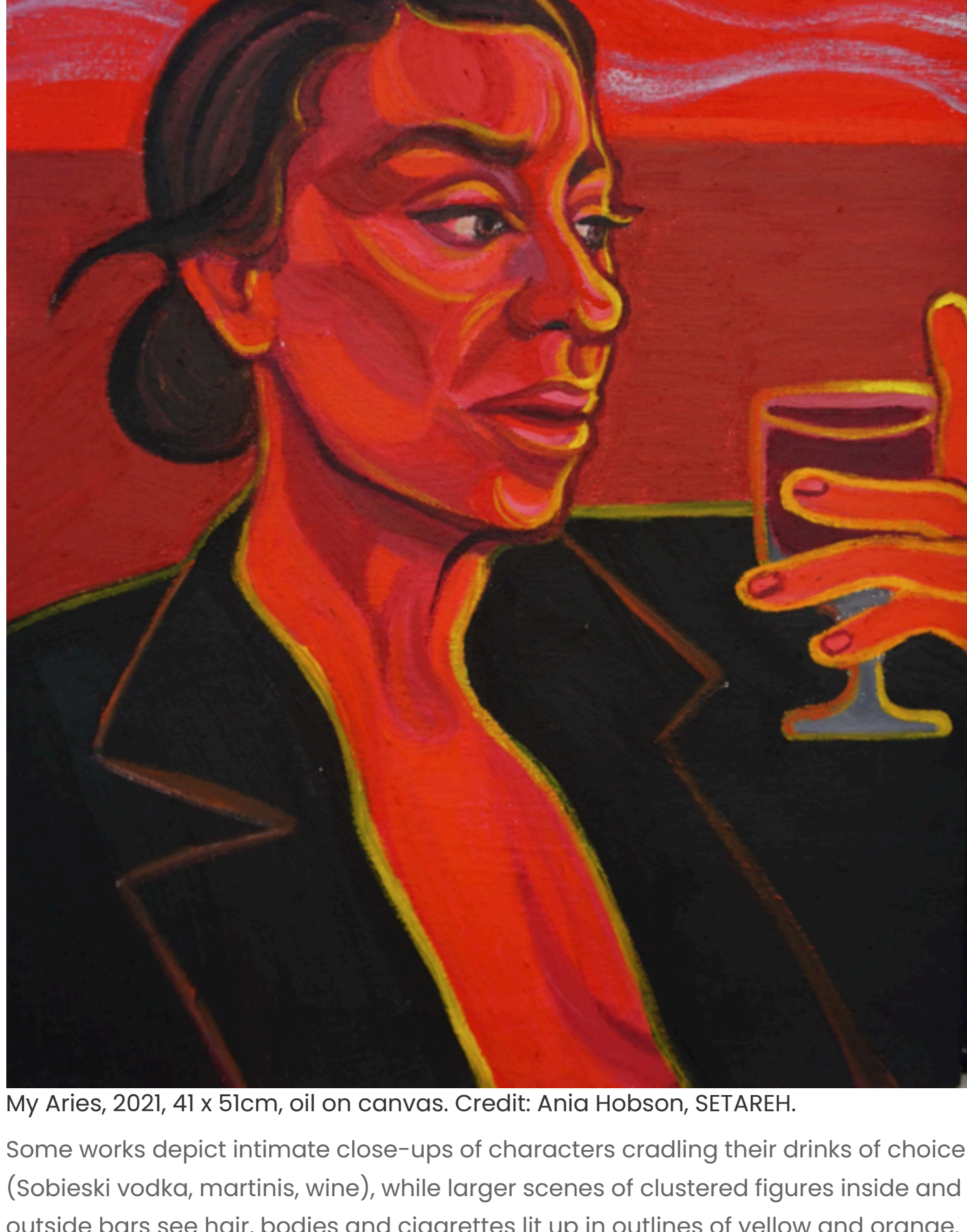
My Aries, 2021, 41 x 51cm, oil on canvas.